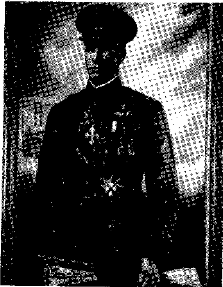
Portrait of General Mitchell.

Other exhibits are being planned and prepared. A cut-away pioneer jet engine is being refurbished and a suitable display around it is being designed. Early propellers will be featured in another exhibit. A four-cylinder aviation engine of Milwaukee manufacture will be the subject of another exhibit.