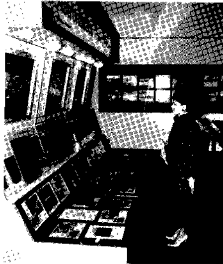
Pat Rowe of the airport staff viewing the Astronautics exhibit.