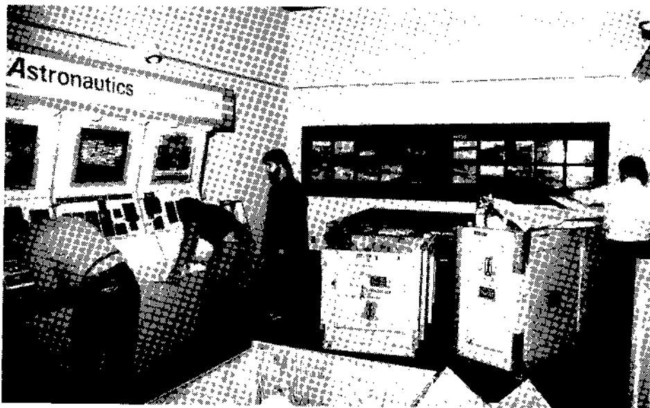
Astronautics crew assembling their exhibit.