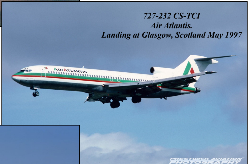
727-232 CS-TCI Air Atlantis. Landing at Glasgow, Scotland May 1997