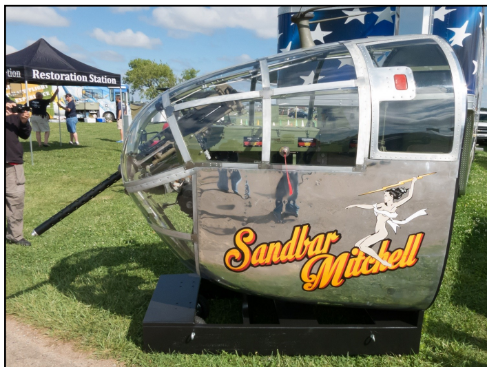
Restored nose section from the B-25

To learn more about the restoration progress, visit Sandbar's website at www.WarbirdsOfGlory.org . The plane is also featured in a chapter in the book Hidden Warbirds II: More Epic Stories of Finding, Recovering, and Rebuilding WWII's Lost Aircraft by Nicholas A. Veronico.