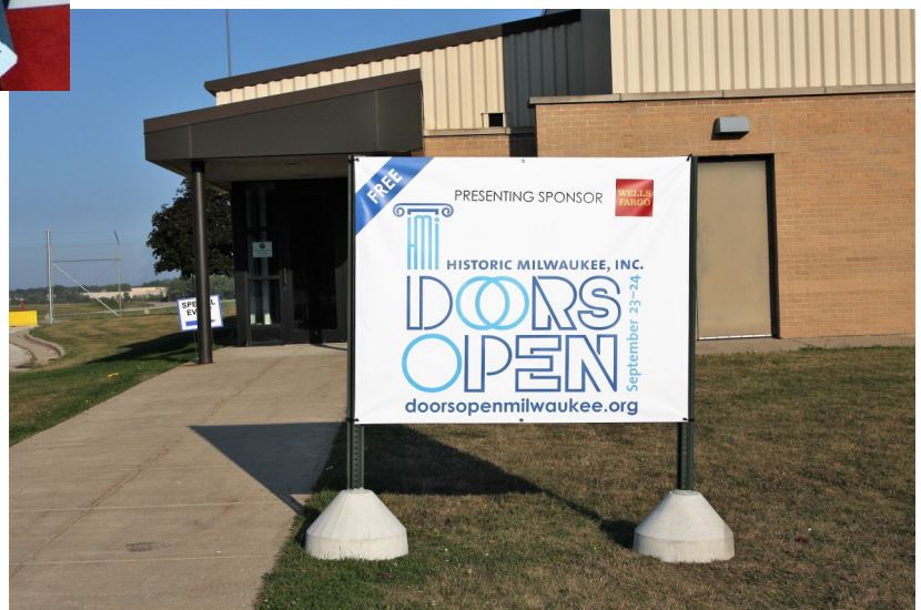
"Doors Open" sign inviting visitors to Mitchell Gallery's open house our archive / office building

See a small selection of photos from the Mitchell Gallery's 2017 Doors Open event scattered inside this newsletter.