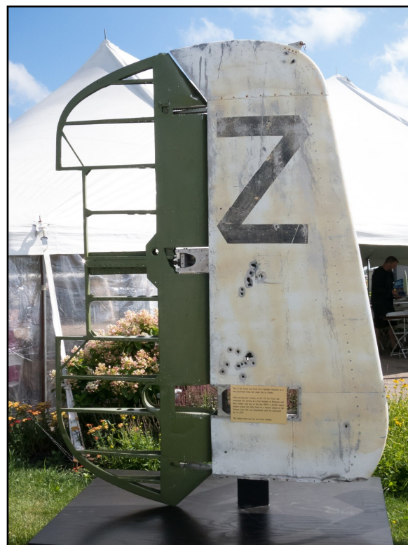
Unrestored tail from Sandbar Mitchell. The bullet holes in the tail were caused by vandals on the river

Next Page: Picture of the B-25 lying on the sandbar