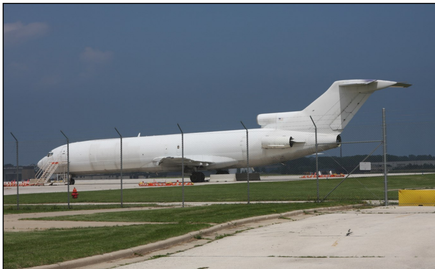
Boeing 727-232F, Former FedEx N498FE, parked at the former 440 th AW ramp, summer 2017.

Since 2010, you may have noticed an anonymous looking and windowless Boeing 727-200 parked at various locations at Gen. Mitchell International Airport. Nobody ever sees it fly because all three of its engines have been removed. So what's the story?